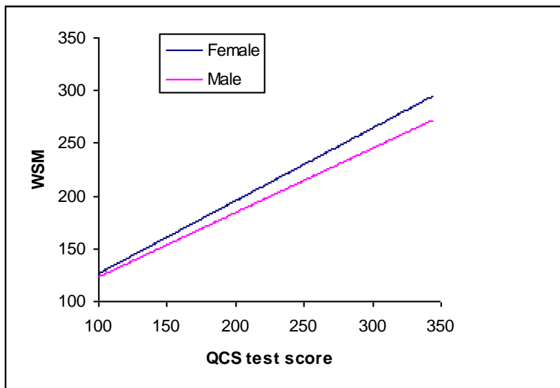
Figure 2: Regressions of scaled WSM on mean QSC Test score for males and females in co-educational schools.

A different picture is seen, however, when the regressions for males and females in single-sex schools are calculated.